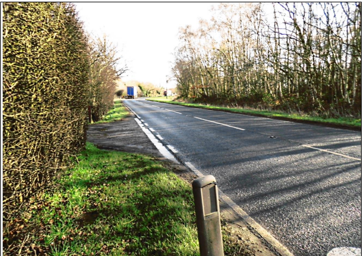
View east down the A163 near the site access