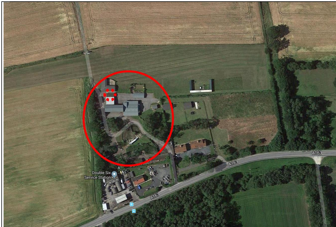
Aerial view of the site