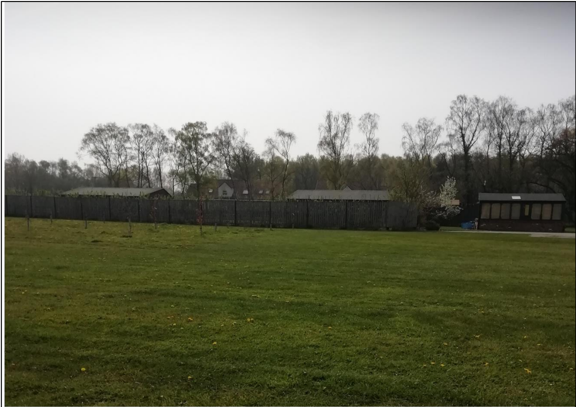
View south towards neighbouring dwellings from the airstrip